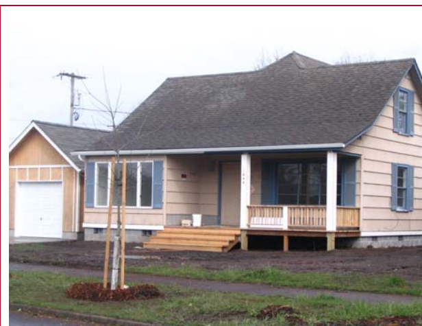
The house is now at 1646 H Street in Springfield. At the writing of this newsletter, renovations are nearly complete. (Photo taken on March 29th.)