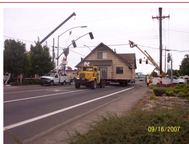
The house move on September 16th was a complex orchestration involving utility poles, street lights, and stopped traffic.

NEDCO's goal in developing homes is to make the opportunity of homeownership more accessible for those with low or moderate income levels. We offer a lease to purchase program for the potential new owners of these homes. Because we realize that sometimes the perfect home for a family is available before the family is financially ready to assume the responsibilities of a mortgage.