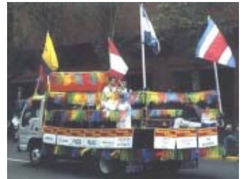
El Grupo Condor Plays on the Mercado Float