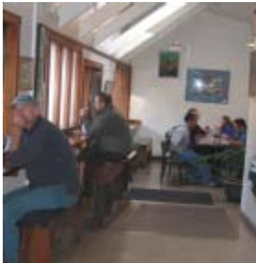
Customers Enjoy Lunch at New Day

that time home to NEDCO’s office, as well.