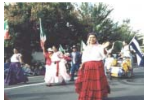
Vendors Wave to the Crowds