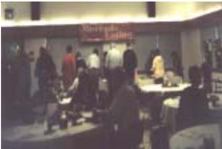
Guests Gather Before the Annual Meeting