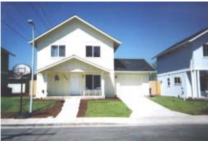
Completed Walnut Orchard Homes

The homes at Walnut Orchard, which are located on Compton Street in Eugene, between Northwest Expressway and N. Park in north (Continued on Page 8)