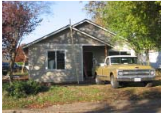
G Street Home Nears Completion

Valley Design and Construction installed new roof trusses, shingles, siding, flooring, plumbing, electricity, and cabinetry to bring