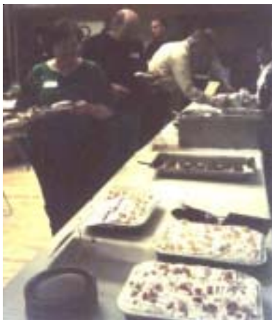
Guests Sample Dishes from Latin America