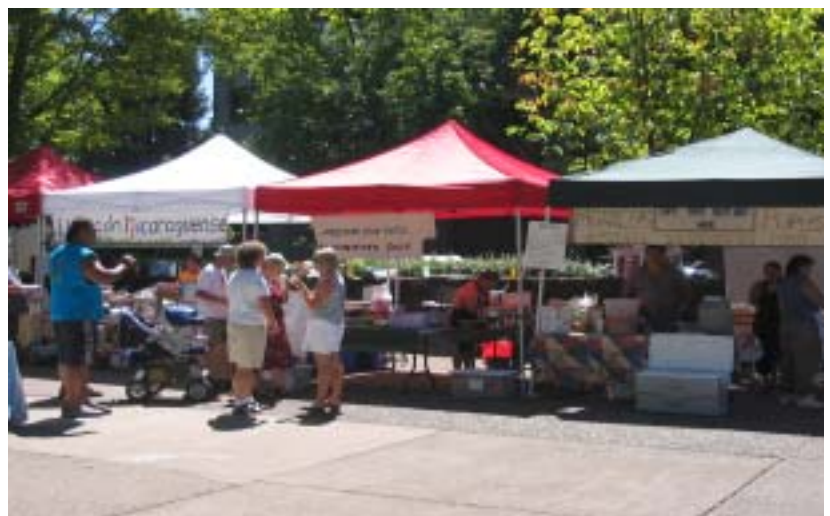
Customers Mingle in Front of Mercado Latino Food Booths