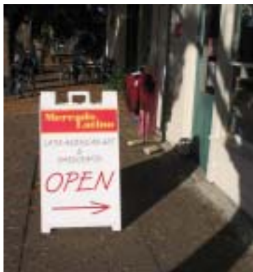
Outside the Mercado Latino Store

Responding to Mercado Latino vendors' interest in continuing with their businesses during the time between market seasons, NEDCO converted part of its office space into a small storefront for art and handcrafts vendors early this October.