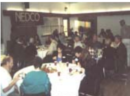
Guests Mingle Over Dinner Prepared by Mercado Vendors