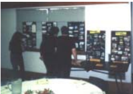
Guests Look at Photos of NEDCO's Accomplishments this Year