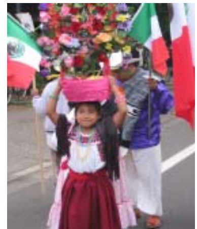
Vendors Represent Mexico